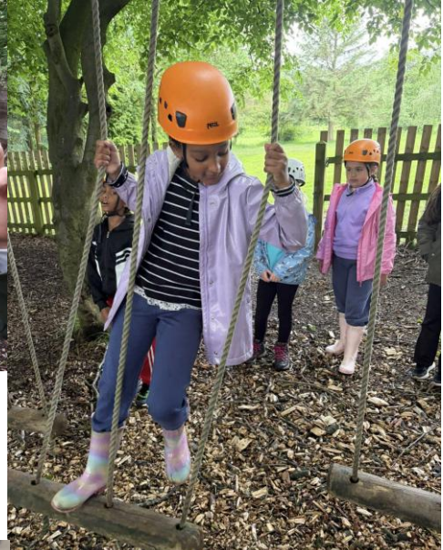
Year 3 Residential – Bramhope Scout Camp